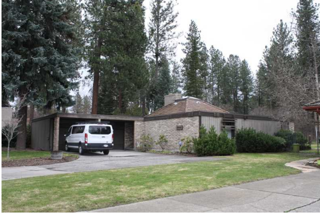
North and west facades