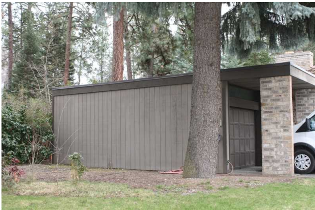
North wing, north facade