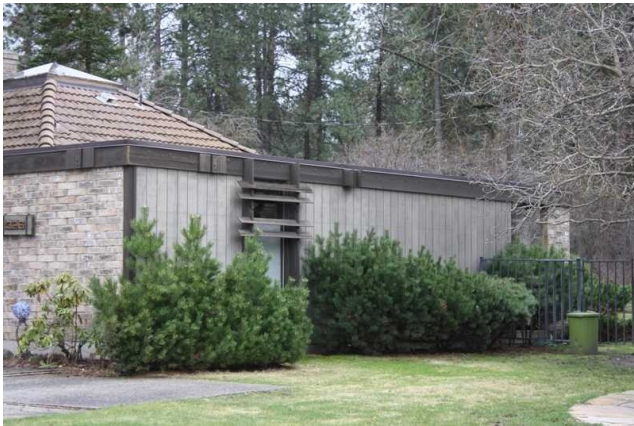
West wing, west facade