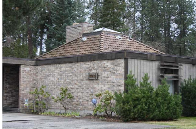
West wing, north facade